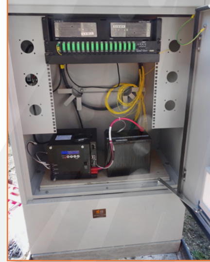
shown with optional 12" pedestal for pad mounting and lifting brackets

Tii's Multi-use Outdoor Versa-Cabinet is designed to safeguard sensitive electrical equipment from harsh environments. With a pitched roof, filtered vents and an optional fan, the OC-V1-38R11 cabinet can be used for a wide variety of broadband applications within a wide variety of environmental conditions. It can be installed on a pole, wall, or pad with optional mounting accessories.