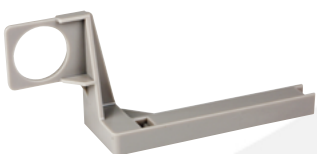
BKT-506F-OT Hardened Fiber Connector Adapter Mounting Bracket