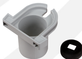
506F-OC Hardened Fiber Connector Mounting Collar with Rubber Boot